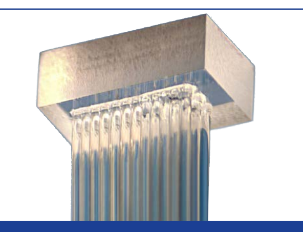
12x3 PM 2D FMA Back Side