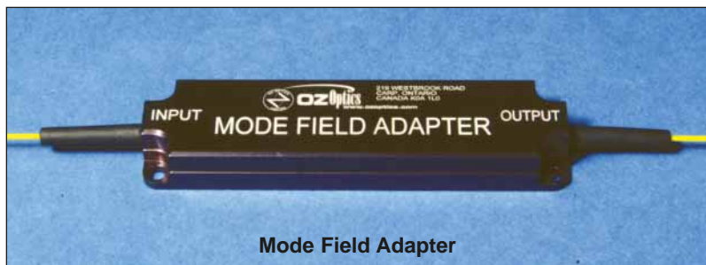
Mode Field Adapter