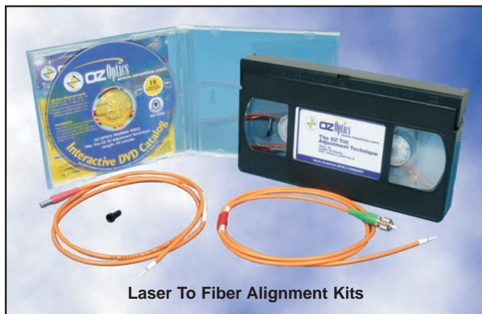
Laser To Fiber Alignment Kits

Perhaps the most difficult task is to align the polarization axis of lasers to the polarization axis of PM fibers. The polarization alignment tool makes this adjustment in seconds. The tool consists of a connector that fits the receptacle on the laser to fiber coupler. Inside the connector is a polarizer, aligned 90 degrees to the key on the connector. The operator simply inserts the tool into the coupler, and monitors the strength of the output light while rotating the laser to fiber coupler. When the light through the tool is blocked as much as possible, the key on the connector is correctly aligned with the key on coupler. The operator then simply connects his PM fiber to the coupler and aligns it for