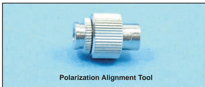
Polarization Alignment Tool