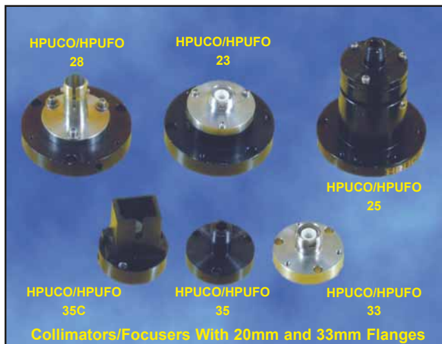
Collimators/Focusers With 20mm and 33mm Flanges

OZ Optics standard tables list the definitions used for each fiber type, as well as conversion factors to convert values to 1/e^2 values. OZ Optics uses 1/e^2 definitions for its calculations of the beam diameter wherever possible.