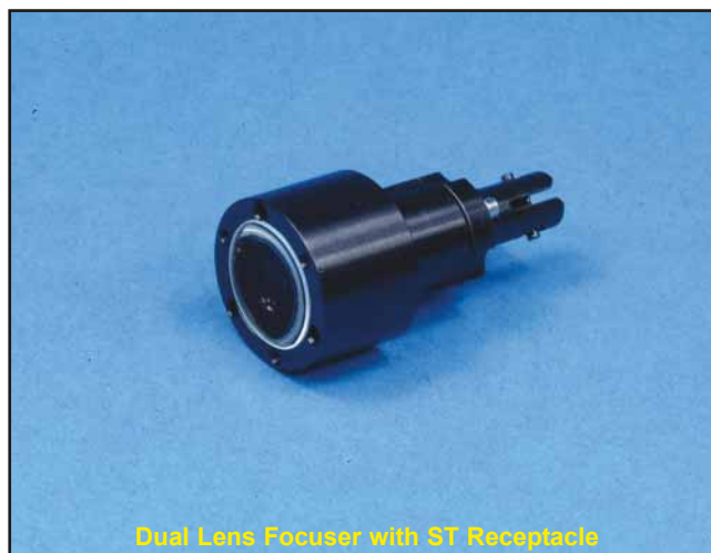
Dual Lens Focuser with ST Receptacle