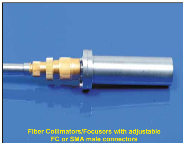
Fiber Collimators/Focusers with adjustable FC or SMA male connectors