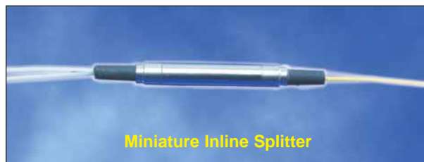
Miniature Inline Splitter

Polarizing Splitters: Polarizing Beam Splitters split incoming light into two orthogonal states. They can also be used to combine the light from two fibers into a single output fiber. When used as a beam combiner, each input signal will transmit along a different output polarization axis.