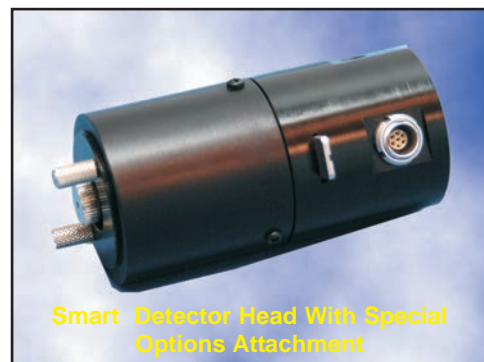
Smart Detector Head With Special Options Attachment