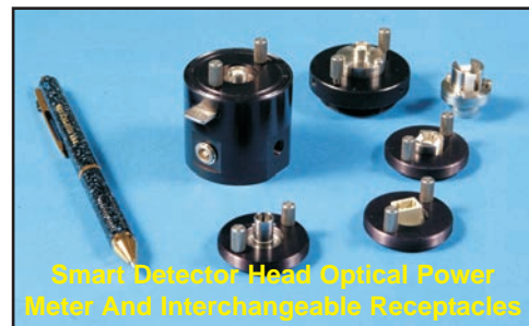
Smart Detector Head Optical Power Meter And Interchangeable Receptacles

The Smart Detector Head can accommodate a variety of standard, interchangeable screw-in receptacles.