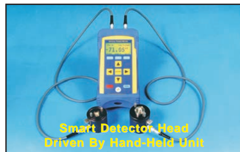
Smart Detector Head Driven By Hand-Held Unit